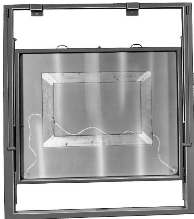
DOUTHITT Model DMW with Screen Loaded and Ready for Imaging