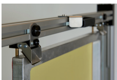
Upper screen holder