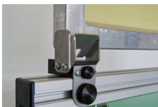
Lower screen holder