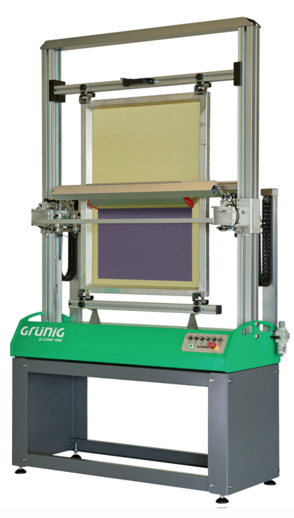
Optional easy-mount floor stand (Option U)