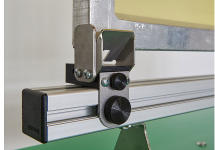
Lower screen holder