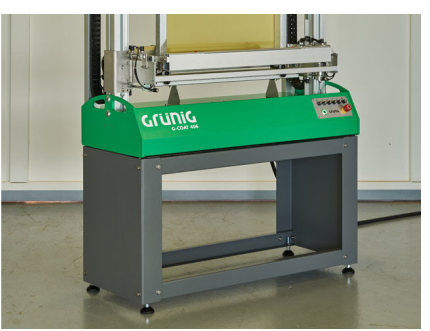
Optional easy-mount floor stand (Option U)