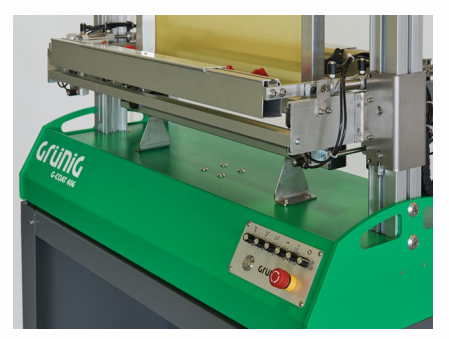
Lower portion of unit on easy-mount stand