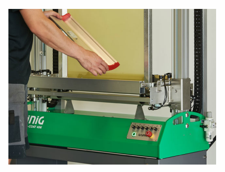
Installation of coating trough