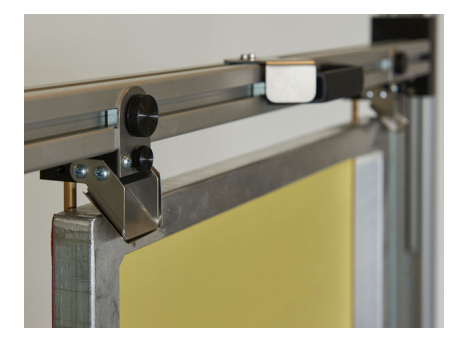
Upper screen holder