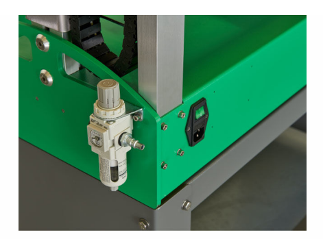
Power and pneumatic connections