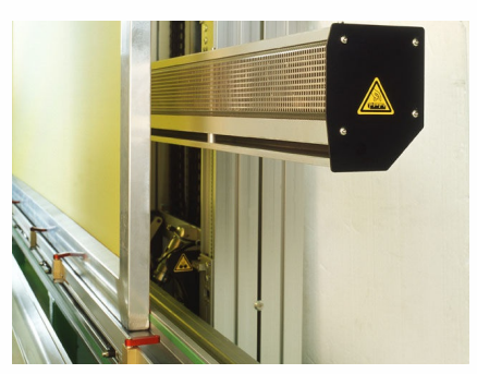
Automatic Air Dryer (Version A2)