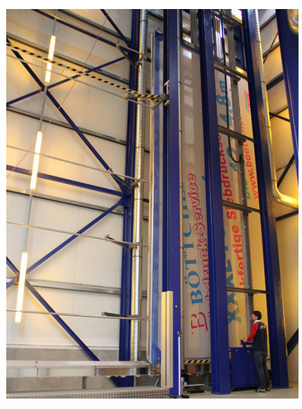
Large Format Screen Support