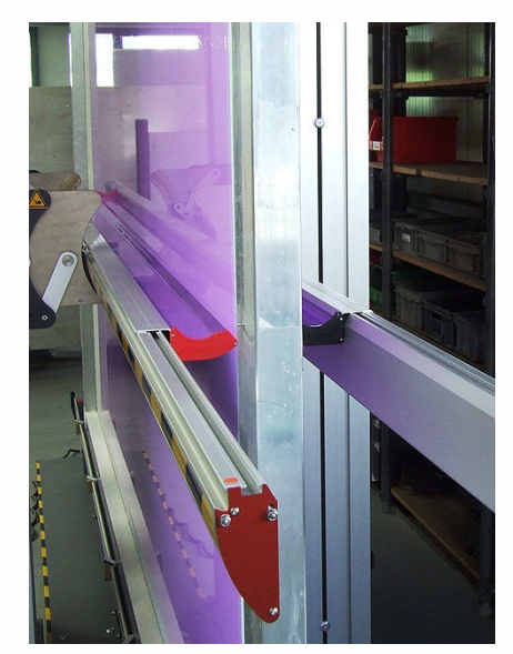
401 Automatic Coating Trough in Use