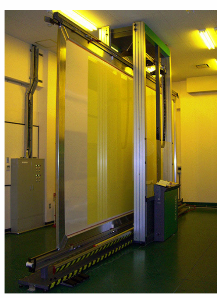
Large Format Screen Support