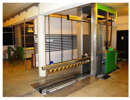
Full Workspace Integration