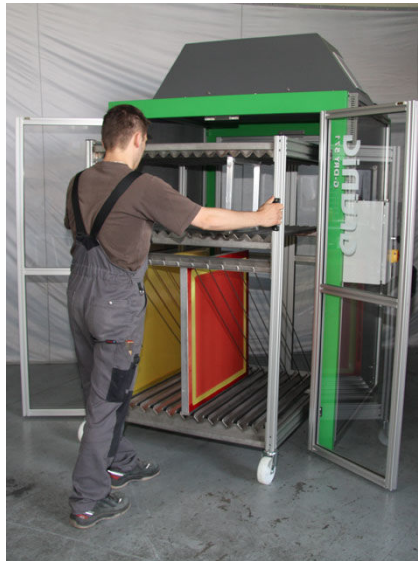
Support for Screen Carts (Option SW)