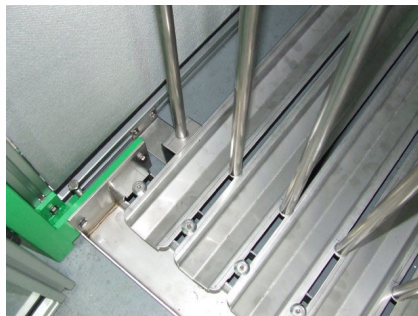
Standard Fixed Screen Supports