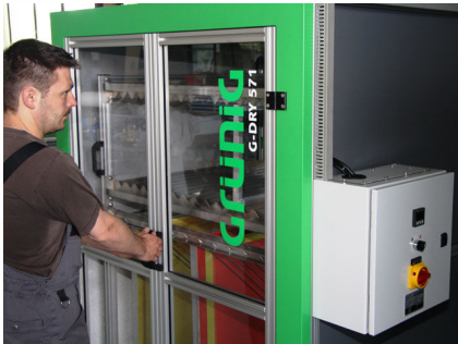
Front Bi-Parting Doors (Version 1)