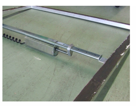
Pneumatic G-STRETCH 208P1