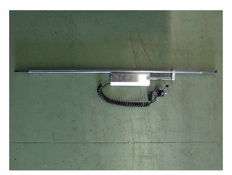
Pneumatic G-STRETCH 208P1