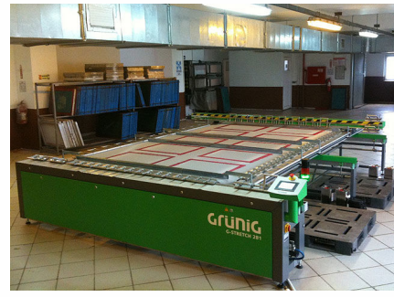
G-STRETCH 281 in Use