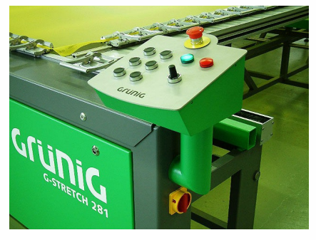
Manual Control Panel (Version A1)