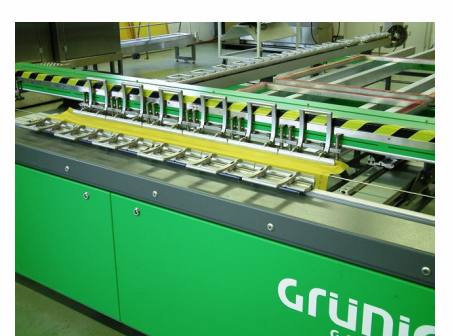
Integrated G-STRETCH 201 Duplex Clamp System