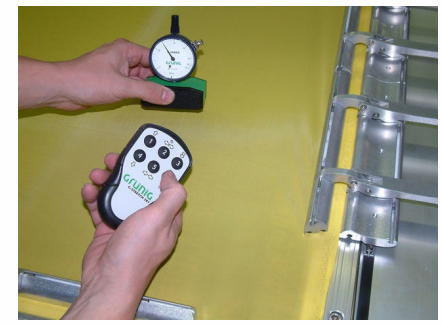
Remote Control in Use (Option F)