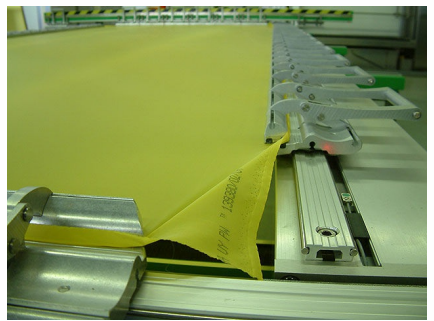
Integrated G-STRETCH 201 Duplex Clamp System