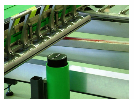
G-CHECK 2 Automated Tension Meter (Option G1, Option G2)