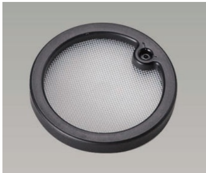
Power Steering Filter