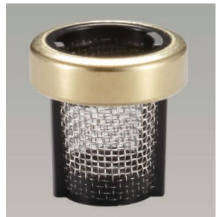
Oil Pump Filter