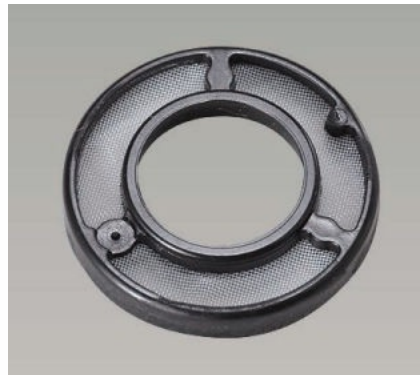
Pressure Regulator Filter