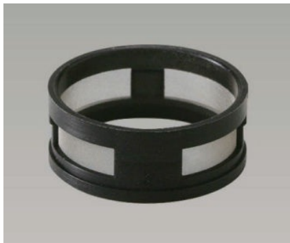
Anti-Lock Brake Filter