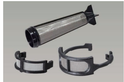
Variable Valve Timing Filter