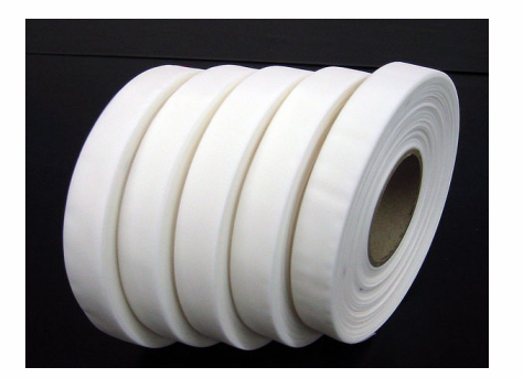
Slitting (Secondary Treatment)