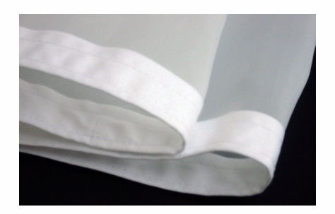
Sewing (Secondary Treatment)