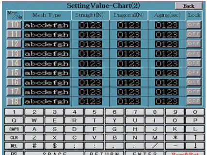
Control Panel Specification Screen