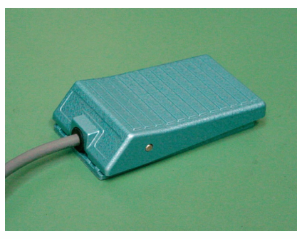
Convenient Foot Switch Activates Corner Stretching