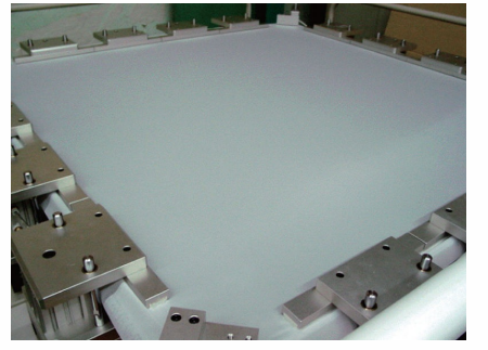
Fabric Stretched to Preset Tension