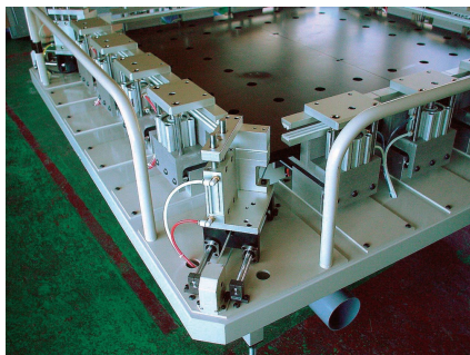
Corner Diagonal Tensioning System