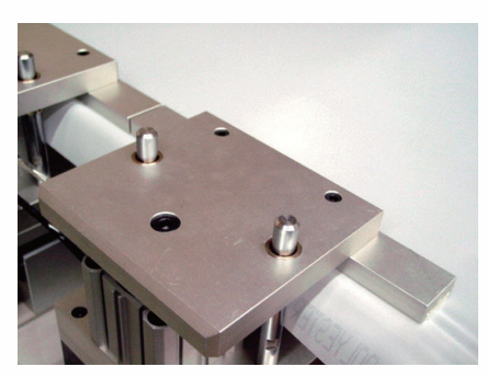
Automatic Clamps Gripping Mesh