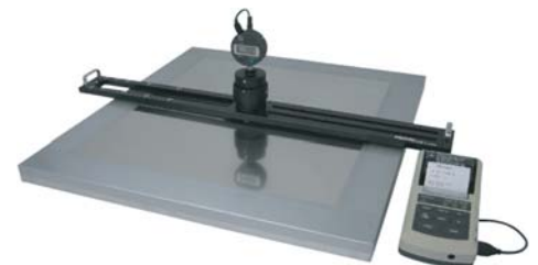
Option for digital type: Printer /DP-1VR

* Specifications and design details may be subject to change.