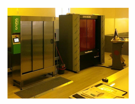
\label{thm:constraint} SignTronic\ Stencil Master \ \ STM-MICRO\ Series \\ in use along side\ Grünig\ Washing\ System