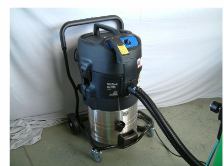
Option S Vacuum Attachment