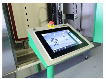
Touch Screen Controls