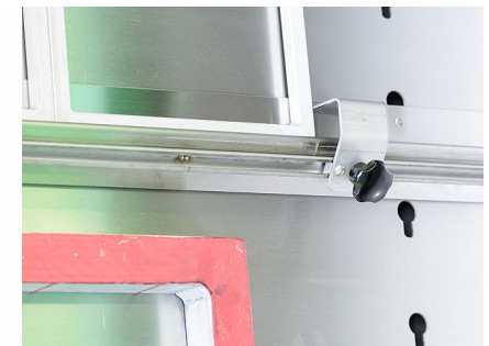
Frame Shelf (Option Z)