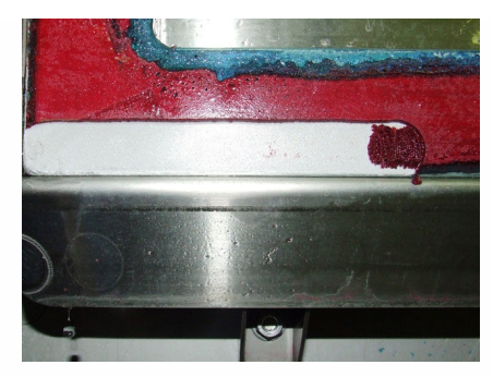
Cleaned Portion of Frame