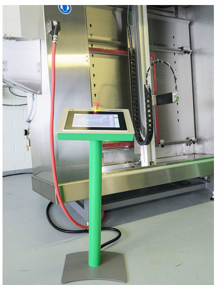
Repositionable Touch Screen Controls