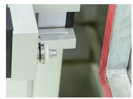
Automated Spray Nozzle