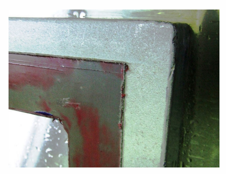
Cleaned Portion of Frame