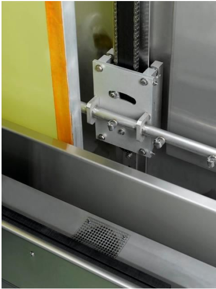
Drive and Spray Carriage