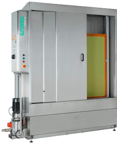
Loading Doors Partially Open