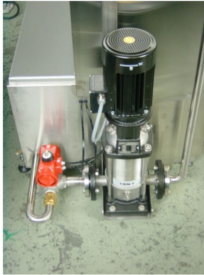
Included High Pressure Water Pump