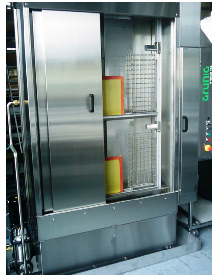
Additional Horizontal Screen Holder (Option Z2)