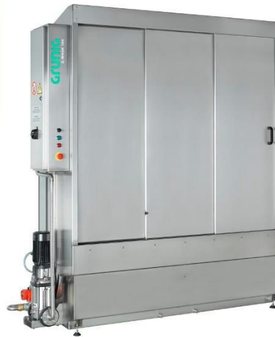
Loading Doors Closed