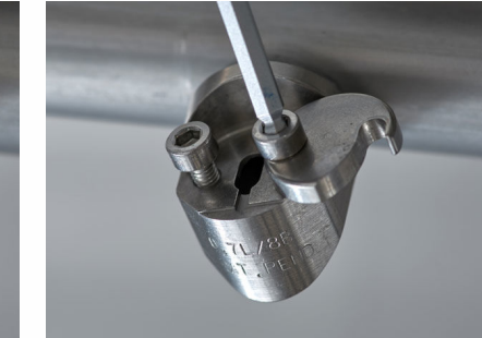
Spray Nozzle Opened for Cleaning and Maintenance