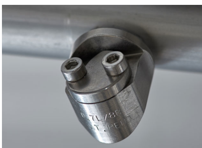
Closed Spray Nozzle