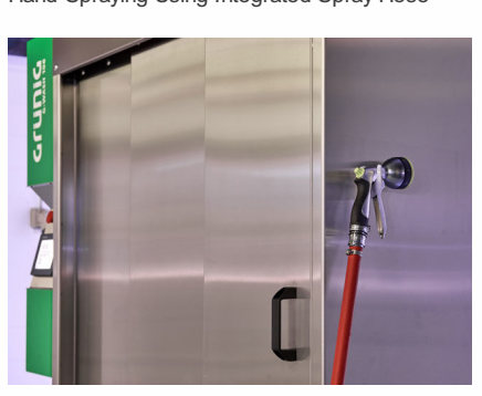
Integrated Spray Hose