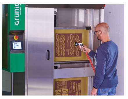
Hand-Spraying Using Integrated Spray Hose