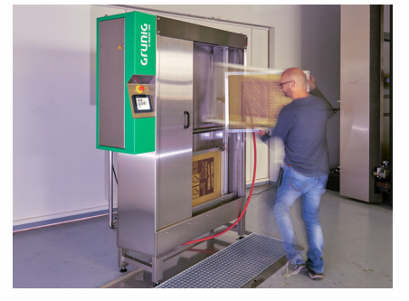
Easy Loading and Unloading