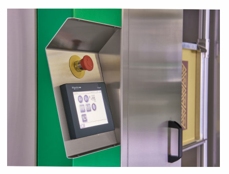
Programmable Touch Screen