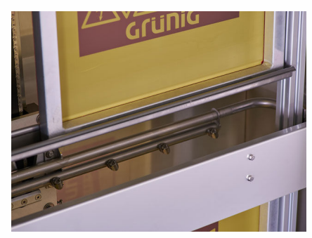
Spray Nozzle Carriage