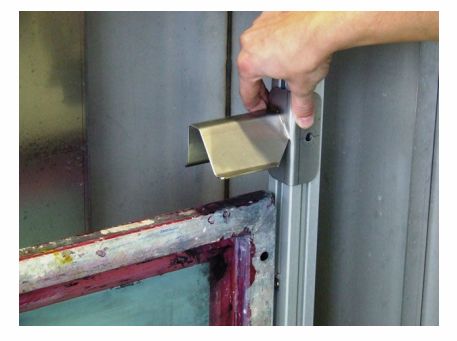
Adjustable Screen Holder