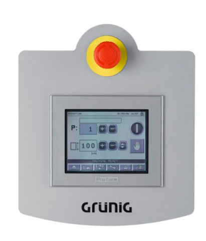
Touch Screen Control Panel