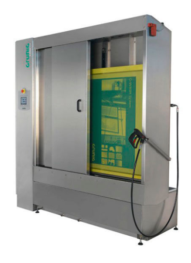
Open Loading Doors