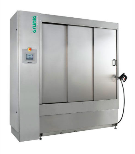
Closed Loading Doors