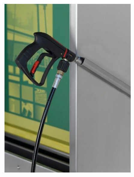
Manual High Pressure Water Gun (Option H)