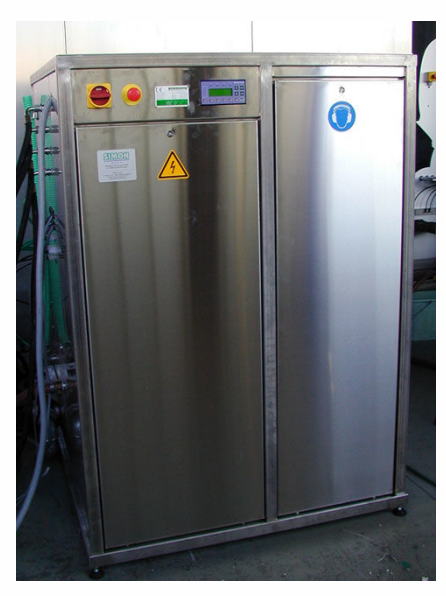
Remote Pressure/Power and Control Unit