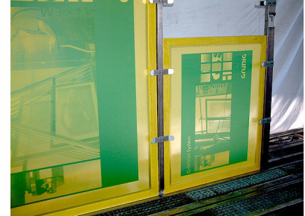
Additional Screen Holder (Option Z)