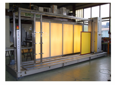
Backlit Screens (Option L)