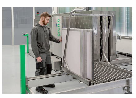
G-WASH 170XS-DUO with Screen Magazine Feeder