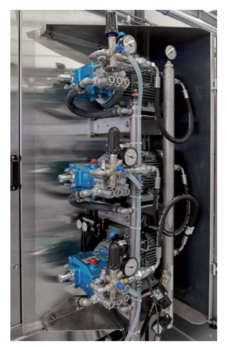
High Pressure Pump System