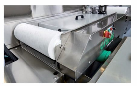
Closed-Circuit Tank with Inclined Filter