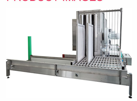
Gr�nig G-WASH 170XS-DUO IN-LINE Screen Cleaning System