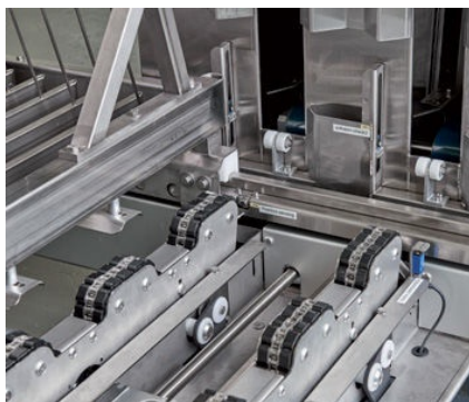
Screen Magazine Feeder Mechanism