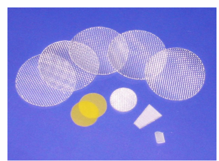
Die Cutting (Secondary Treatment)