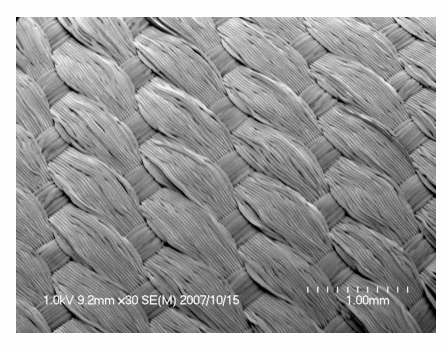
NBC Polypropylene Mesh in Non-Standard Specialty Multifilament 2x2 Twill Weave for Membrane Filter