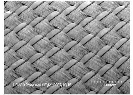
NBC Polypropylene Mesh in Non-Standard Specialty Multi/Monofilament Plain Weave for Membrane Filter