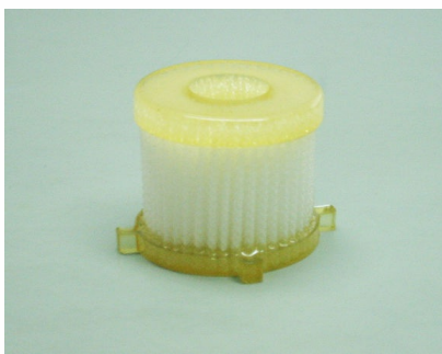
Pleating (Secondary Treatment)